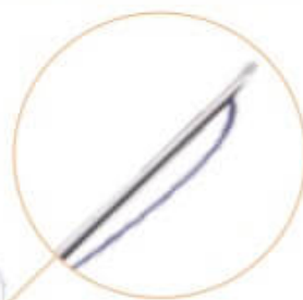
Fine Needle MONO